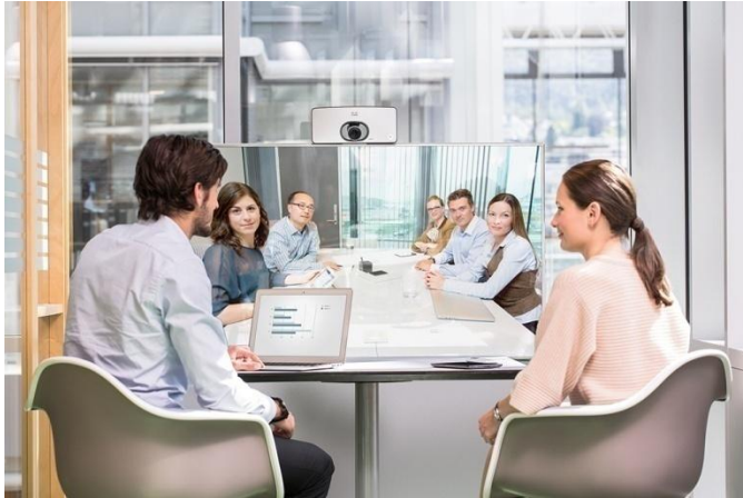
Figure 4. Cisco Spark Room System

Setting up is easy. All you need in the room is a monitor or display, a Cisco TelePresence SX10 Spark room system device and Internet access (Figure 5).