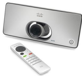
Figure 5. Cisco TelePresence SX10 Quick Set

The SX10 is an all-in-one unit designed to video-enable your small collaboration spaces, offering great affordability for businesses just starting out with telepresence. With the SX10, you can also extend telepresence pervasively throughout your organization. Table 3 lists its features and benefits.