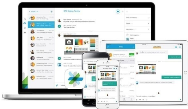
Figure 2. Cisco Spark Message

Cisco Spark message is the cloud-based persistent business messaging service within the application. Messaging capabilities are accessible from any device and come standard with all paid levels of the service (Figure 2).