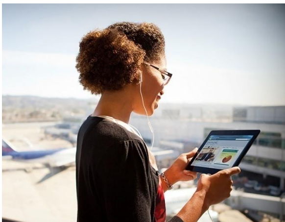
Figure 3. Cisco Spark Meeting

Cisco Spark has two meeting offers to suit different work styles. Both offers integrate deeply with the app for added benefits including before-, during-, and after-meeting messaging and content sharing. The first offer, basic meetings, is ideal for people who want to conduct instant meetings between Cisco Spark users only and need audio, video, and screen-sharing capabilities. Advanced meetings, the second offer, allow you to meet with anyone on any device with all the rich capabilities of the industry-leading Cisco WebEx meetings solution. Both offers center on the Cisco Spark app.