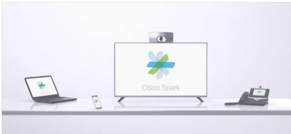
Figure 1. Cisco Spark Service

Bring your teams together in a place that makes it easy to keep people and work connected. With our partners we offer a complete business collaboration service that enables you to message, meet, and call anyone, anywhere, at any time. The service is hosted by Cisco and sold by Cisco certified partners; it's called Cisco Spark™ service (Figure 1).