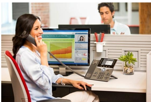
Figure 6. Cisco Spark Call

Cisco Spark call capabilities provide a cloud-based phone system that enables voice and video communications for mobile, home, and office environments (Figure 6).